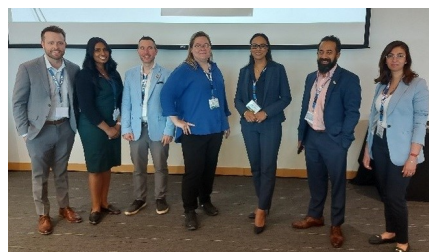
OFPA Board of Directors

This year's OFPA Annual Spring Technical Meeting and Clive Kingsbury Video Competition offered all attendees a deeper look into various aspects of