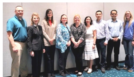
FAFP Board of Directors

More than 70 attendees took part in the Florida Association for Food Protection (FAFP) 2023 Annual Educational Conference (AEC) May 16-18 near Disney Springs in Lake Buena Vista, Florida. The AEC features the most current research, best practices, and cutting-edge strategies for protecting the food supply.